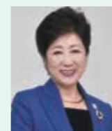
Ms. Yuriko Koike

The Going-Global Innovations Competition awards ceremony will be held. The ceremony is held to honor innovative and promising products, technologies, and services, and to spread the word about them both in and outside Japan. The award-winning companies will also have exhibition booths in the venue.